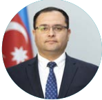
Majnun Mammadov Minister, Ministry of Agriculture of the Republic, Azerbaijan