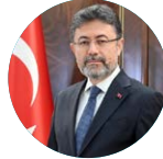
İbrahim Yumaklı Minister, Ministry of Agriculture and Forestry, Türkiye